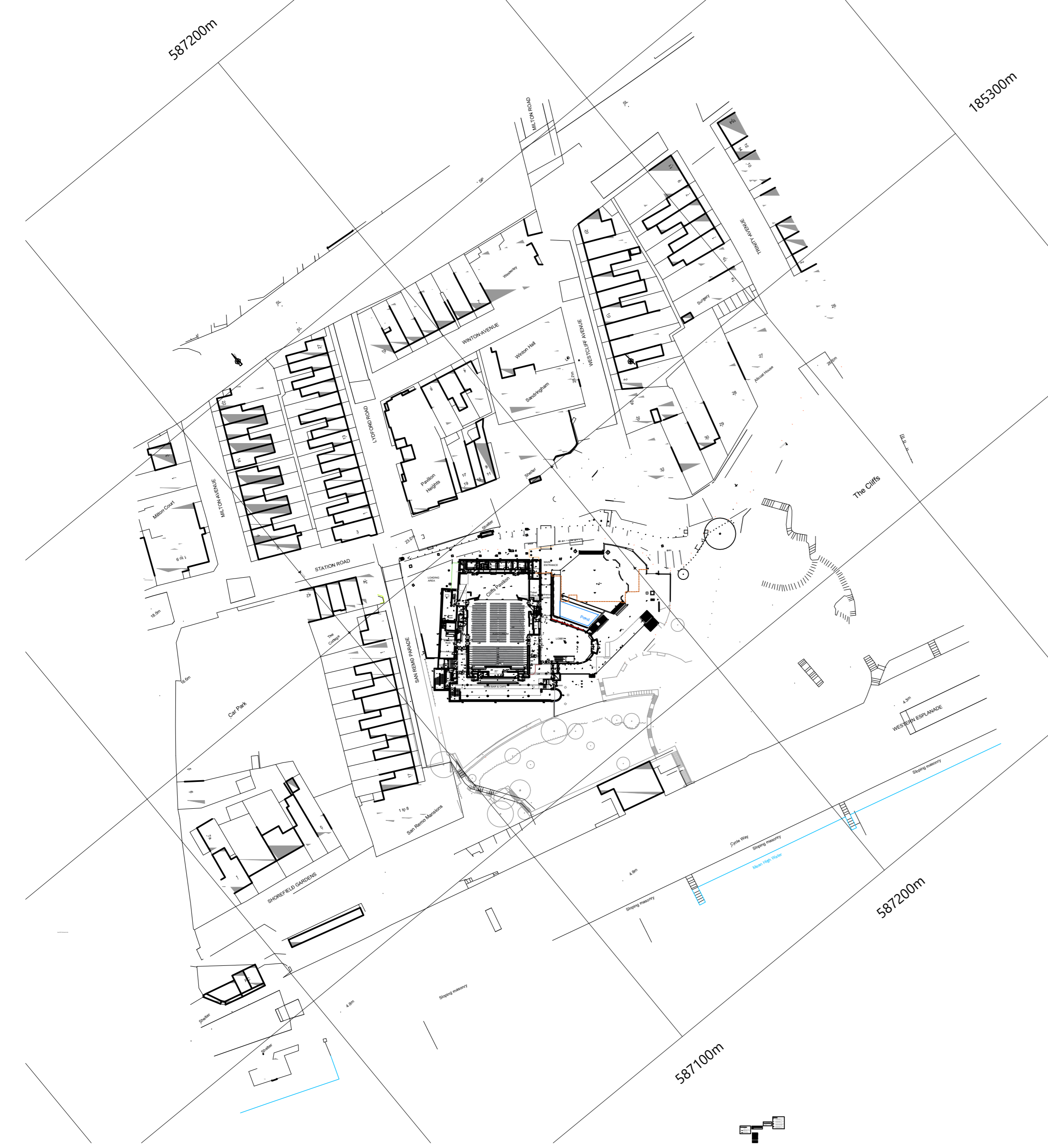
Existing Location Plan 1:1250 at A0

©Crown Copyright and database rights 2023 OS Licence no. 100059809