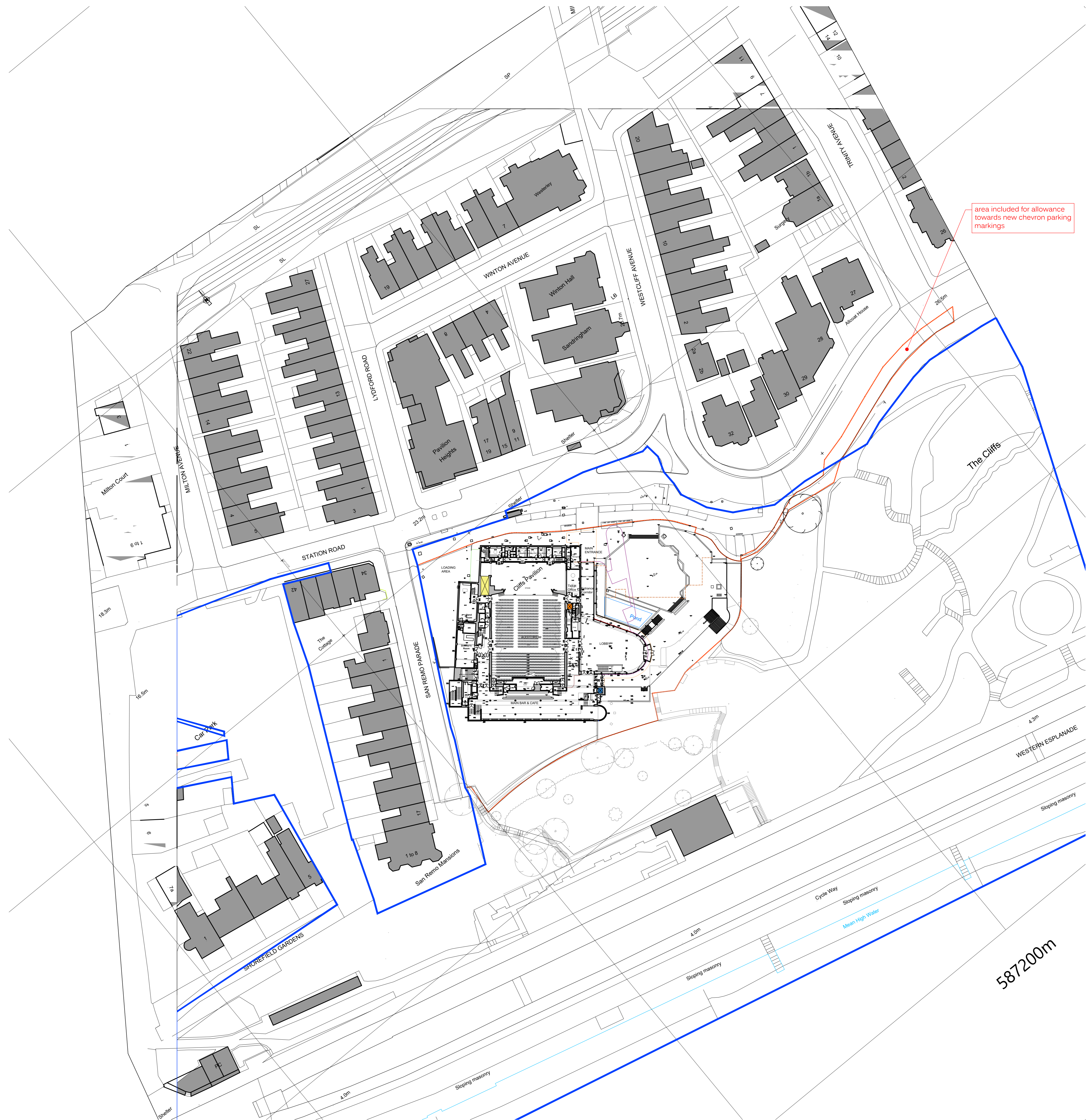
Existing Site Plan 1:500 at A0

©Crown Copyright and database rights 2023 OS Licence no. 100059809